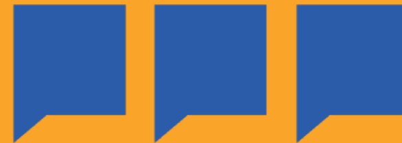
Option A. Color version.

Strengthening brand presence as a design, ad and marketing element of TrustYou's branding, and guide in our products (UI).