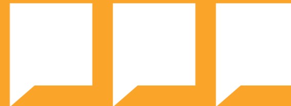
Option B. White version.